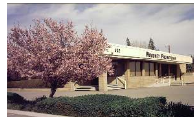
Springtime blossoms at Wordnet